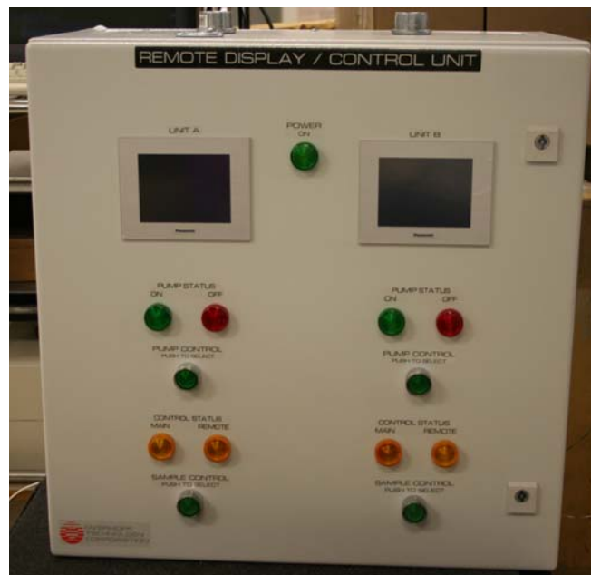
300/400 UNITS - FIXED CONFIGURATION:PAGE 24