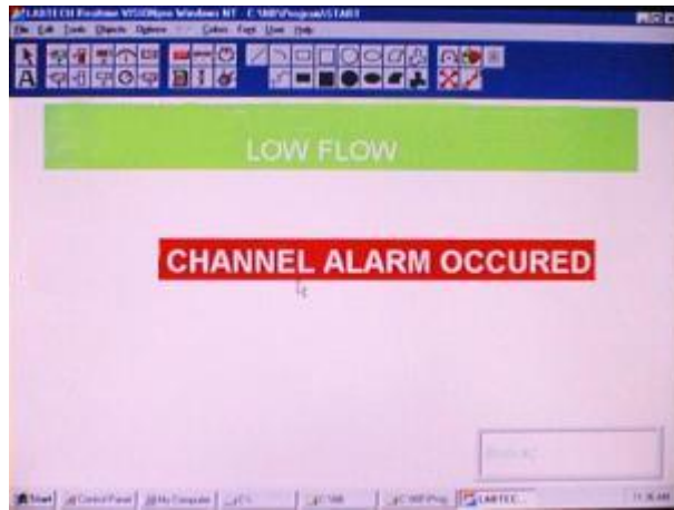
TYPICAL DISPLAY SCREENS

型号 CAM-3XG 连续空气监测器自动存储所有数据，设定参数到 3.5 寸软盘中，此数据能够在彩色显示屏上读取。