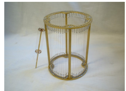
Wire-Grid Chamber Design, reduces tritium contamination by up to 1000x

Gas ports are added to the compensation chamber for HTO specific measurement (noble gas compensation)