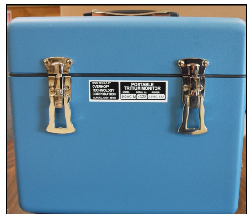
Hinged, Gasketed Enclosure

The Overhoff Technology Model 400AC-M portable tritium monitor is an instrument with unequalled performance in extreme conditions; designed for rugged applications which require a monitor that can withstand water, shock/drop, and severe temperatures.